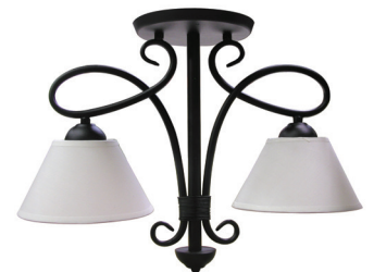
Savannah Two Bulb Dinette