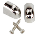
RNLL-RGB-SS-CAP End caps for RNLL thin diffused sealed