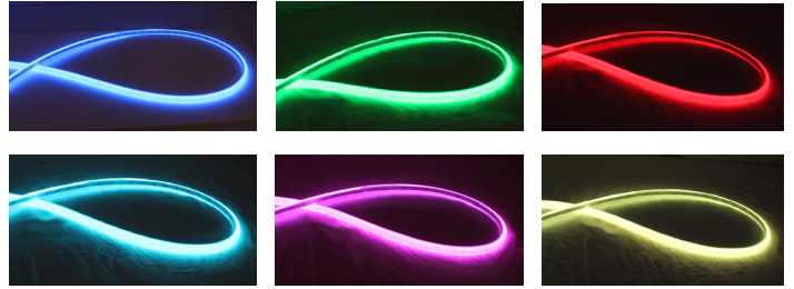
(Diffused style - RNLL, shown above)