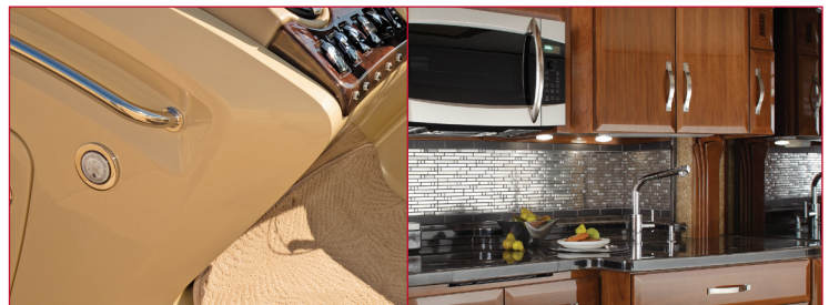
Exterior Courtesy Lighting