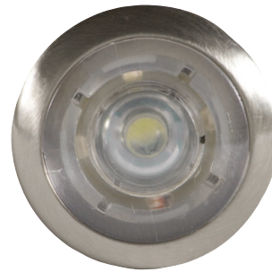
Shown with 69501A-NI collar